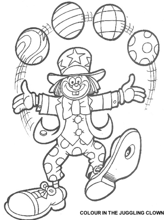
CLOWNS HAVE BIG FUNNY SHOES

KNOCK KNOCK WHO'S THERE? WOODEN SHOE WOODEN SHOE WHO? WOODEN SHOE LIKE TO KNOW!