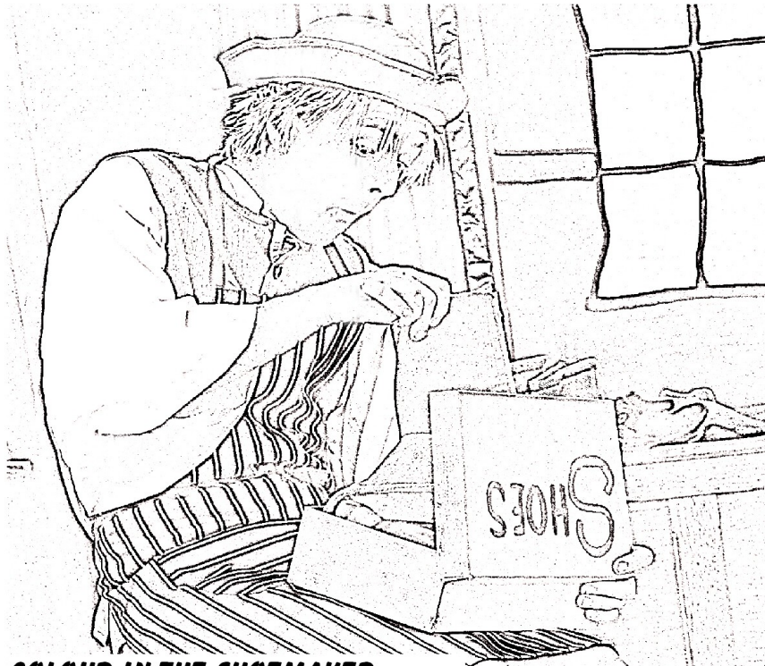
COLOUR IN THE SHOEMAKER

IN 'GIGGLE ALONG... SHOEMAKER' THERE ARE LOTS OF MIX UPS! THE SHOEMAKER'S WIFE THINKS THEY HAVE RATS, SHE DOESN'T REALISE LITTLE ELVES LIVE IN THE SHOP.